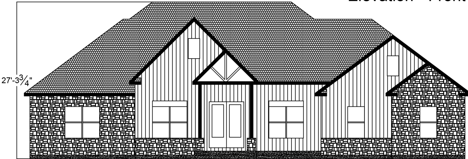
Elevation - Front